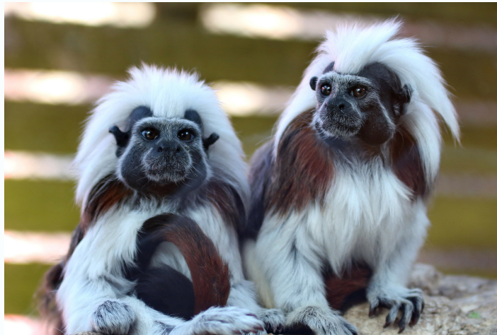
Cotton Top Tamarins

*An ethologist studies the behavior of animals in their natural environment