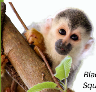
Black-Crowned Squirrel Monkey

_____ (136) _____ (79) _____ (75) _____ (45)